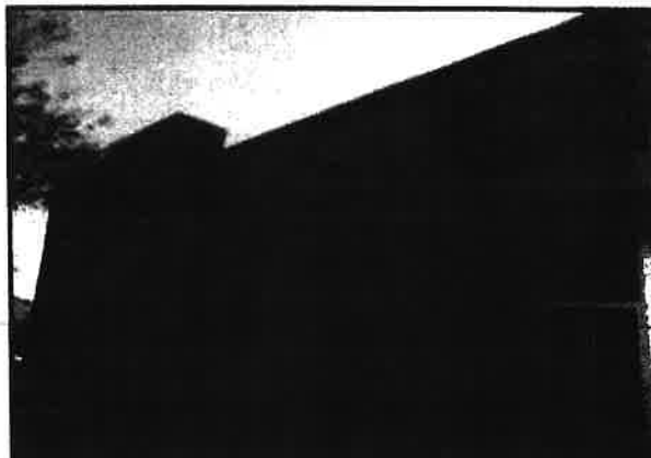
West Valley – In West 101 Business Center 1850 N. 95th Avenue, Ste 182, Phoenix AZ 85037 North of McDowell Road