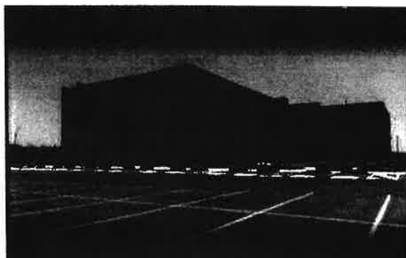
Northwest Valley – ValleyWise Comprehensive Health Center 8088 W. Whitney Drive – 2nd Floor, Ste 2A, Peoria, AZ 85345

Corner of Grand Avenue & Cotton Crossing