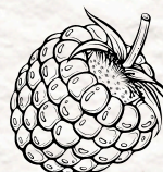
WILD RED BERRIES