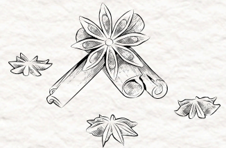
WARM BAKING SPICE