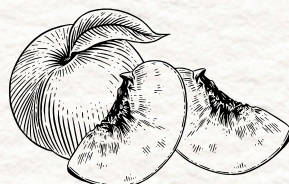
RIPE STONE FRUIT