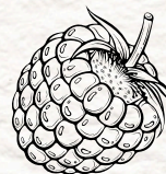
WILD RED BERRIES