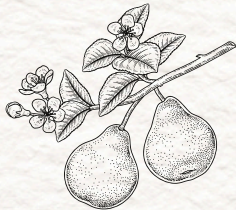
DRIED ORCHARD FRUIT

In the glass, it is layered and evolving. Dried orchard fruit, baked apple, and preserved lemon unfold into toasted nuts, spice, and a subtle oxidative complexity. There is a quiet depth here, amplified by its zero dosage and lack of fining or filtration. The mousse is gentle, integrated into a wine that feels almost still at its core, like a great mature white Burgundy with a pulse of energy running through it.