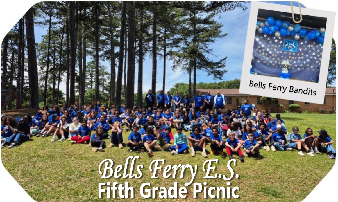
Bells Ferry E.S. Fifth Grade Picnic