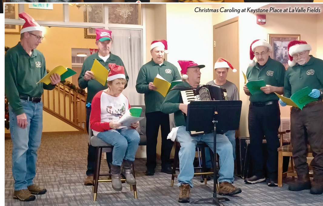
Christmas Caroling at Keystone Place at La Valle Fields