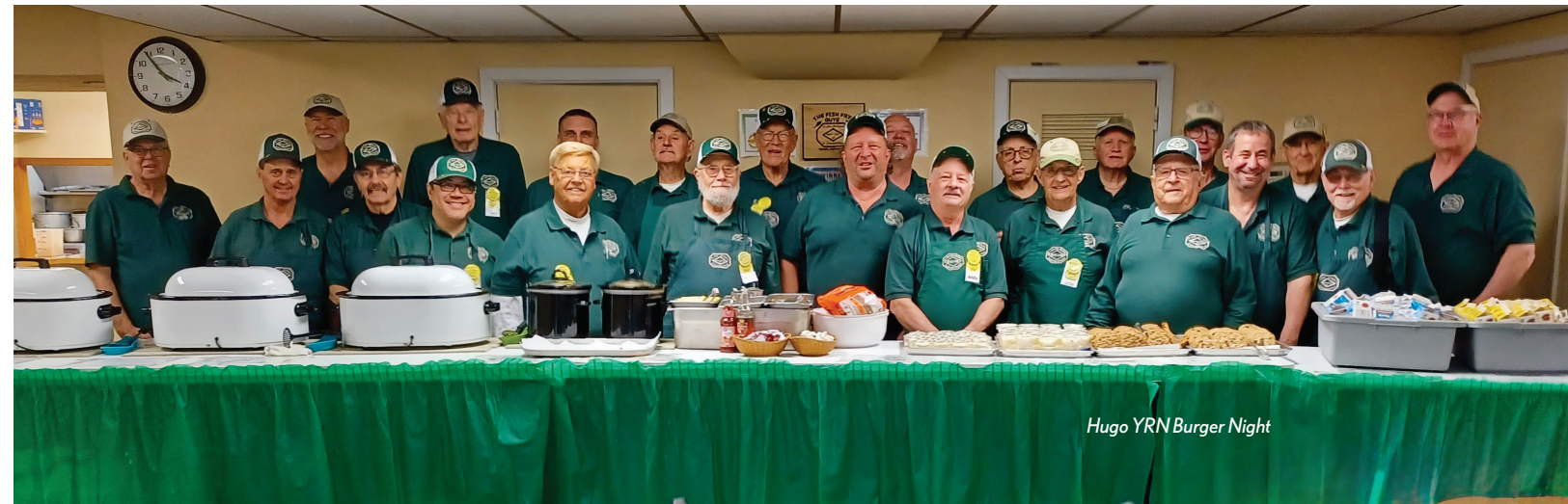
Hugo YRN Burger Night

Over the years many improvements and upgrades have taken place in the kitchen, such as new fryers and a new air make-up and fire suppression system, which keeps the kitchen safe during the high volume of kitchen activity over the first six Fridays of Lent. According to Bill, the Men's Club served over 3,600 meals during Lent last year, averaging out to over 600 meals served during each three hour event. The growth has continued from 2,214 meals in 2013 to 3,626 meals in 2025, a 64 percent increase year over year! The proceeds of their fish fry have allowed them to give back to those in need. In 2025, they were able to help the parish and community with over $21,000 in donations! They also run a 50/50 raffle with the proceeds going to the Hugo Good Neighbor Food Shelf and the Centennial