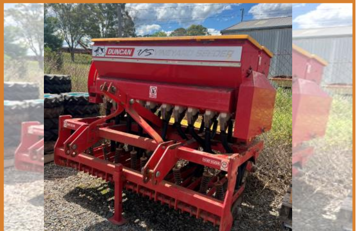
Duncan Vineyard Seeder $P.O.A For more information phone our sales team