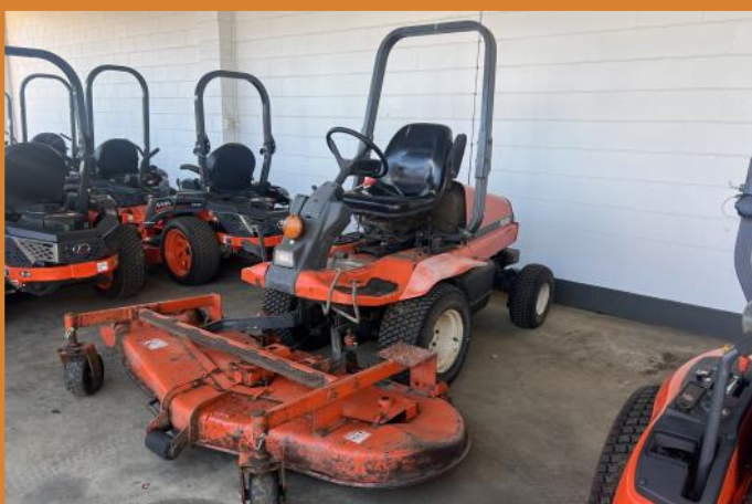
Kubota F3060 $P.O.A For more information phone our sales team