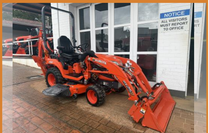
Kubota BX25 $P.O.A For more information phone our sales team