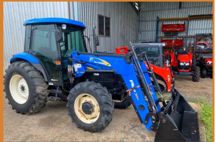
NEW HOLLAND TD90 $55,000 For more information phone our sales team