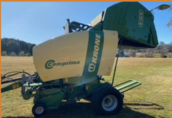
KRONE COMPRIMA BALER $44,000 – O.N.O