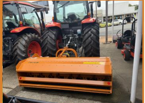
BERTI TSB250 MULCHER