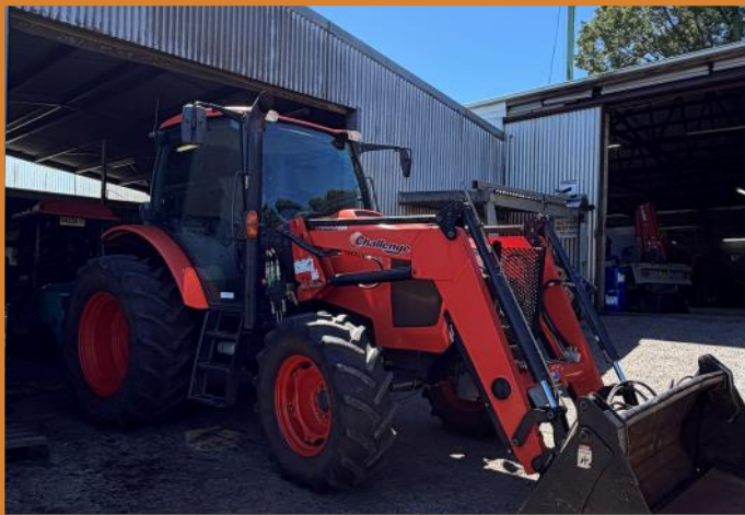
Kubota MGX110 $P.O.A For more information phone our sales team