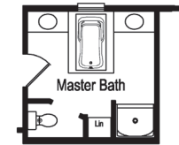
First Floor Plan Layout 9 foot Ceilings Optional Master Bath