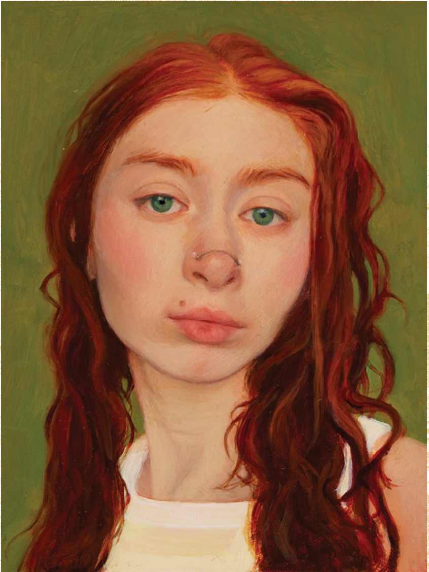
Oliver Murphy Lana 2025 oil on wood panel 24 x 18cm