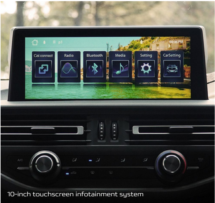
10-inch touchscreen infotainment system

From long-haul journeys to quick city commutes, features like cruise control, a refrigerated glove box and an impressive high-definition 10-inch infotainment touchscreen, all keep you comfortable, connected and in command.