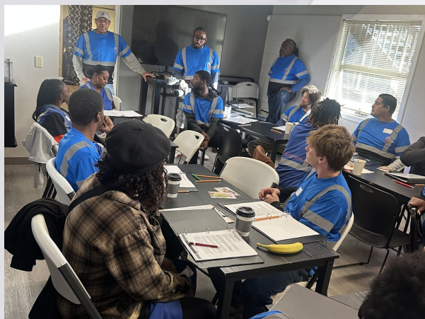
January 30th, 11am - GGV Community Center, 105 Drake Ave

In partnership with Burbank Housing and Tradeswomen, Inc., this program has proven to be a strong pathway for participants to build new skills, gain confidence, and pursue thriving careers in the construction field.