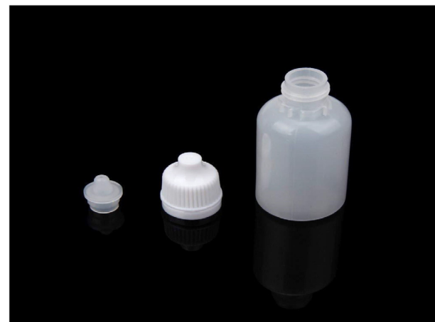
Figure 1: Picture of 10ml plastic squeezable dropper bottle from Bleiou.

patients at 3-month follow-up (Figure 2). Mean IOP reduction in the left eye was significant ( p=0.031 ) after 3 months of compounded solution use when compared with baseline (Figure 2B). The utilization of the combination therapy was more effective at lowering IOP than administration of each of the medications separately. Further, this method allows for the use of personalized medications that are accessible by patients and covered by insurance. No adverse events were noted. Patients reported better compliance and reduced hyperemia. Given that none of the doses were changed, it is reasonable to assume that the compounded therapy was more effective because patients demonstrated increased persistency of use. Adherence rates in glaucoma are low compared to the treatment of other chronic illnesses [5]. Use of one medication twice daily reduces user error, saves time, and is easier to adhere to than several individual drugs. Compounding is also cost-effective, allowing patients more time between refilling medications. Patients are also exposed to fewer preservatives, which can result in eyelid erythema, follicular hyperplasia, conjunctival hyperemia, and dry-eye like symptoms [4,6].