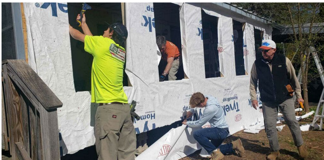
2026 Habitat for Humanity

Prerequisite for this course is successful completion of Biology.