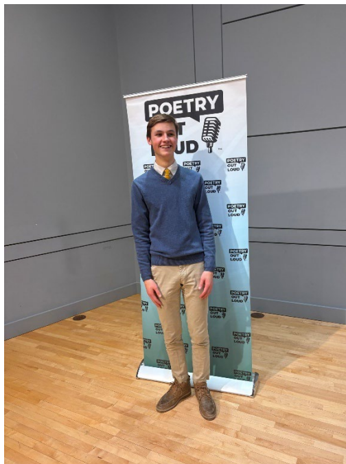
State Finalist – 2026 Poetry Out Loud

This one-semester course is a blend of literary readings, poetic performances, and informative presentation. Students will explore, read, and write poetry and learn about both classic and contemporary poets. They will have the opportunity to “teach” the class after becoming an expert on a poet and that poet’s style and approach. Students deepen their knowledge and understanding of poetry and poetic terms and devices. This class will, through reading and writing poetry, slow students down and allow them to look deeply at the world around them. They will come to view poetry as a way to transform the world. Students have expressed that this course is a welcome oasis from their other academic demands.