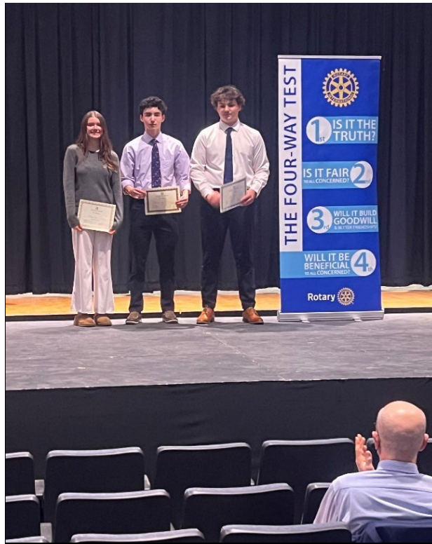
First, second, and third place winners in Rotary Four-Way Speech Contest