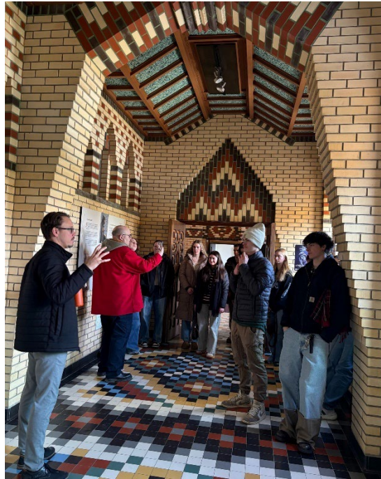
Abbaye de Saint-Benoit-du-Lac, Quebec

This course reviews the emergence of various belief systems and their differences and similarities. Students explore the role of religious belief in the course of human history. Whenever possible, speakers representing various religions are invited to the class. Special emphasis is given to the five major religions: Hinduism, Buddhism, Judaism, Christianity, and Islam.