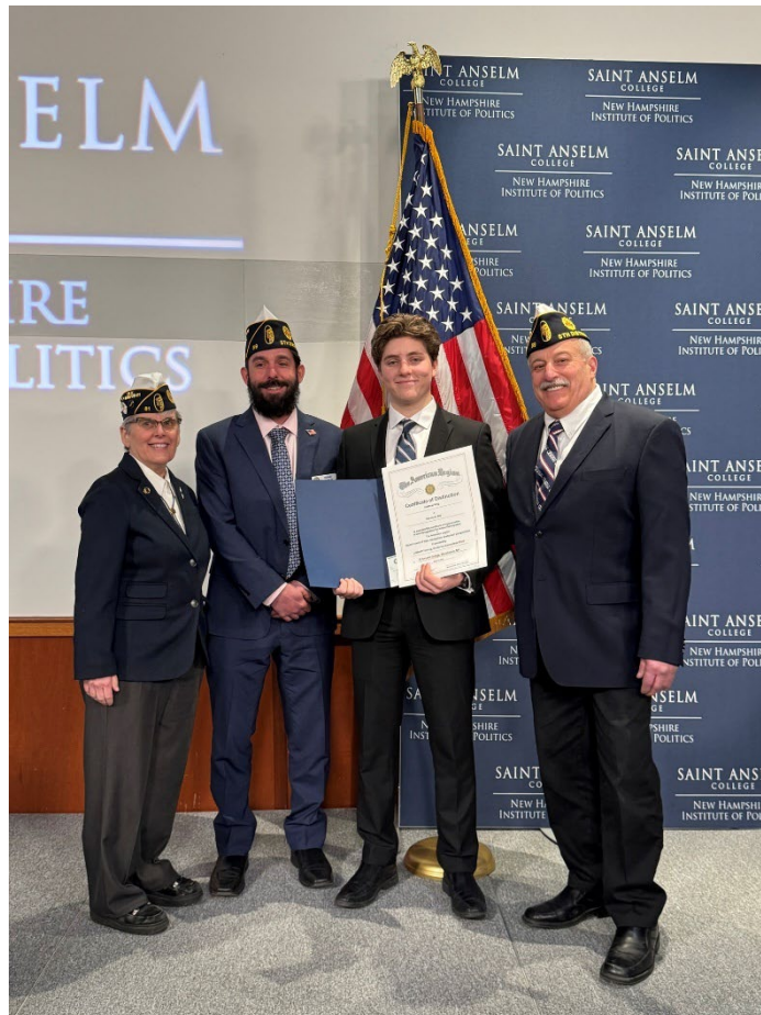
State Winner – American Legion Oratorical Contest