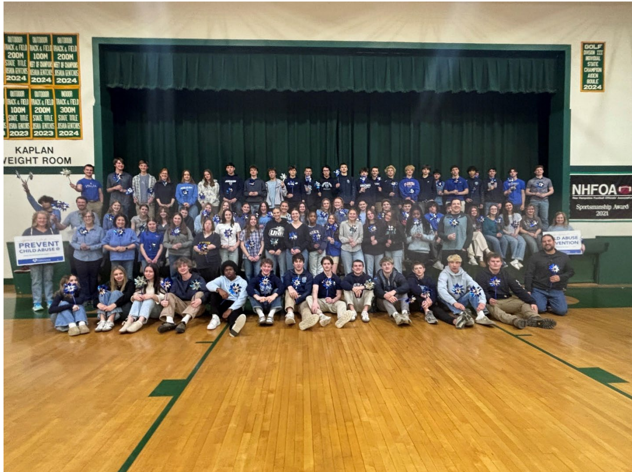
Child Abuse Prevention Week 2026

In order to help create a more engaged and well-informed participant in a civil society this introductory course will focus on the concepts and skills needed for students who are interested in criminal law and criminal justice. In hopes to give students the tools necessary to make changes in their community students in this course will be given a practical approach to the legal system through relevant topics and active participation. Topics will include how criminal law influences policing, adjudication, corrections, and special issues such as juvenile justice, drugs, and terrorism. We will discuss how our individual rights and freedoms influence the need for public safety, order, and security. You will interact in activities, online web exercises, professional guest visits, and lectures. Major topics will include the US court system, criminal law, policing, criminal trials, and prison sentencing.