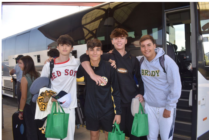
Our Spanish Exchange Guests

Prerequisite for this course is successful completion of Spanish II with an 80% of better and permission of Instructor.