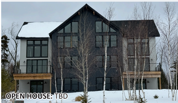
OPEN HOUSE: TBD

Opportunity to finish this multi unit project on the 25± acres.