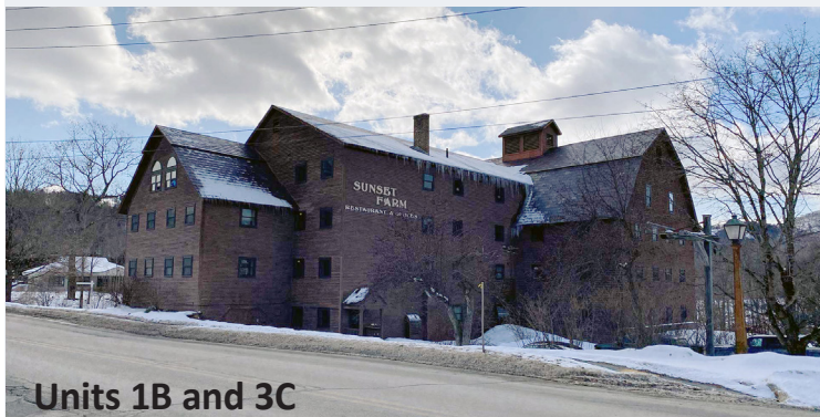
Units 1B and 3C

217102 Maxham Meadow Way, Woodstock, VT 05701