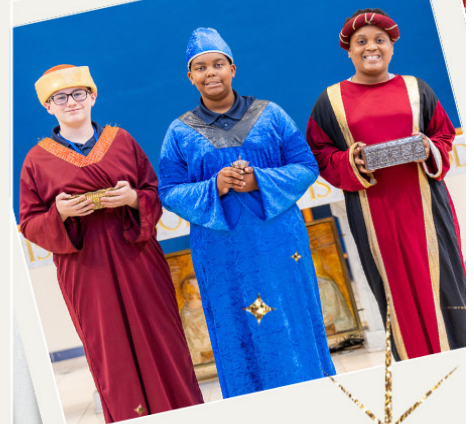
THE CAST OF 2025 CHRISTMAS PROGRAM, "THE HOLY STORY"