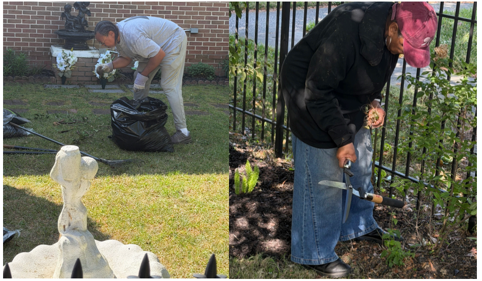
Preparing the Memorial Garden for Easter