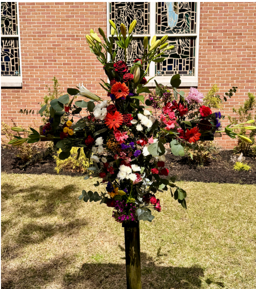
Flowering of the Cross