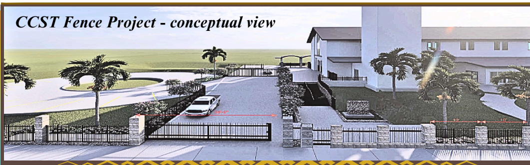
CCST Fence Project - conceptual view