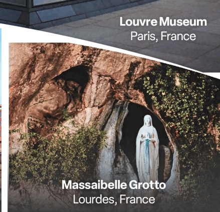
Massaielle Grotto Lourdes, France