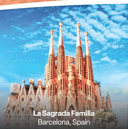
La Sagrada Família Barcelona, Spain