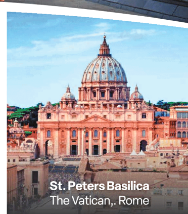
St. Peter's Basilica The Vatican, Rome