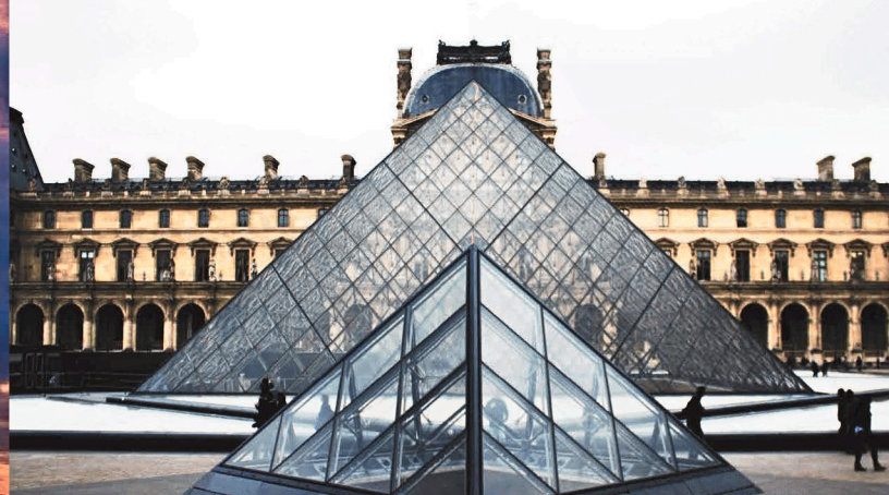
Louvre Museum Paris, France