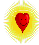
7 TH SUNDAY OF EASTER

We hope to have it open by early June. When it is open it will be announced at all Masses and publicized in the Church bulletin.