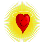
3RD SUNDAY IN EASTER

©2026 TrueQuest Communications. All rights reserved.