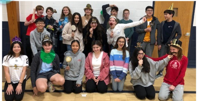
Our Igniters wish you a Happy (Liturgical) New Year!