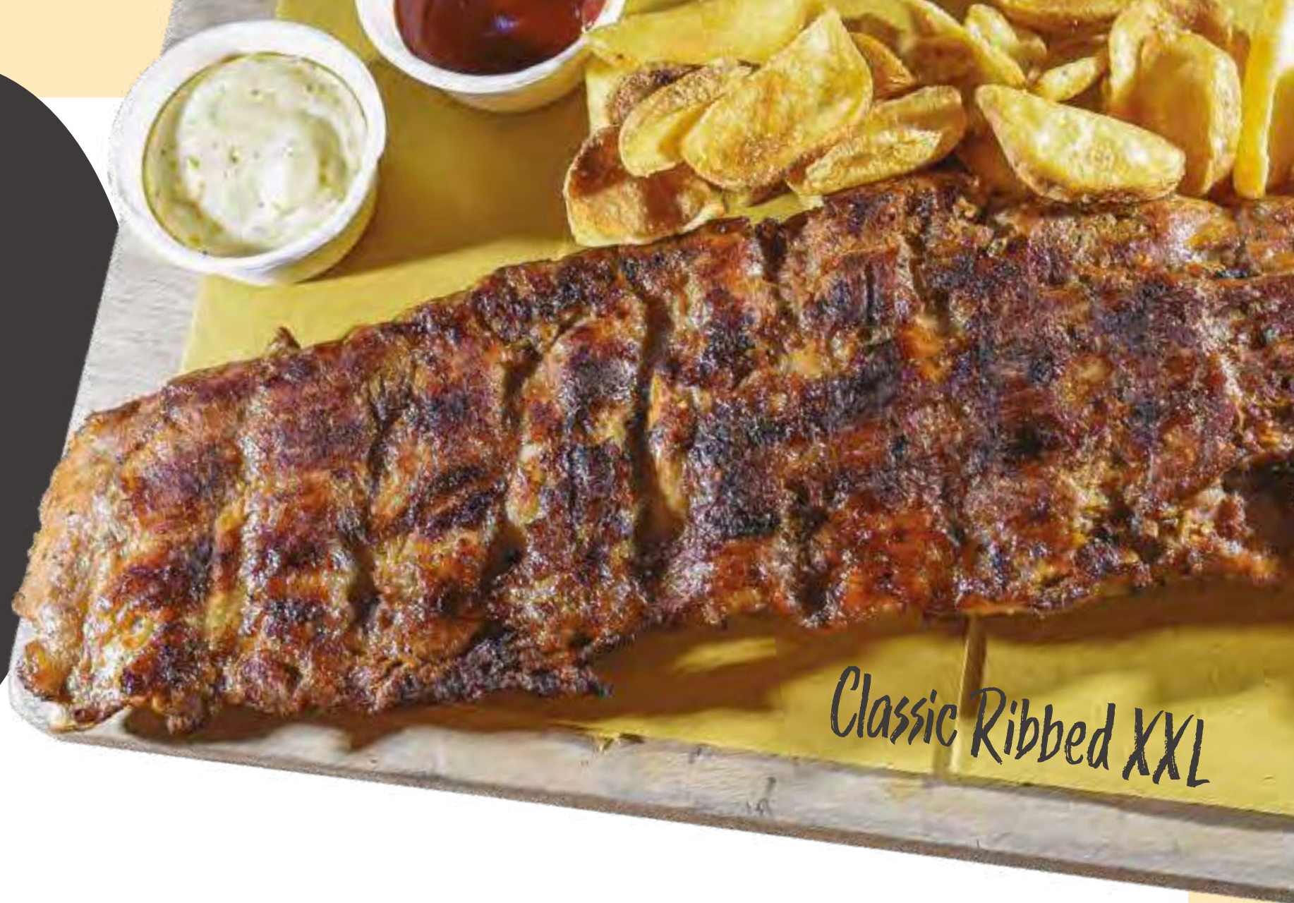
Classic Ribbed XXL