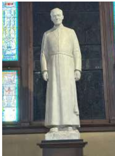
Saint Brother Andre