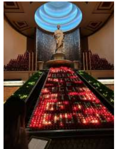
The Saint Joseph Oratory of Mount Royal.