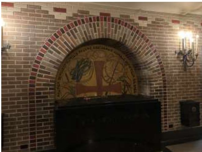
Tomb of Saint Brother Andre at The Saint Joseph Oratory of Mount Royal