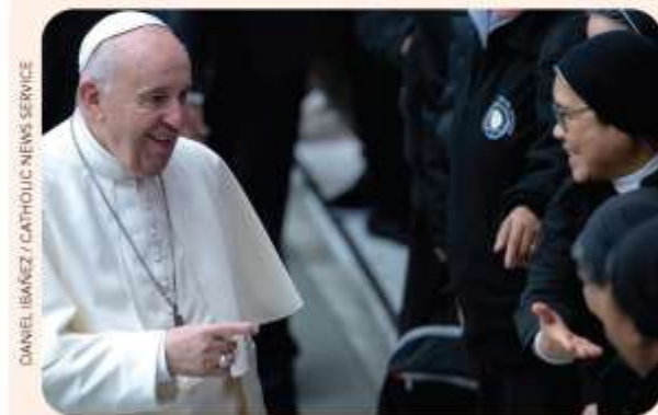
DANIEL IBAÑEZ / CATHOLIC NEWS SERVICE