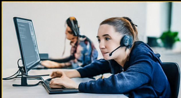
Multimedia, Game & Software Development