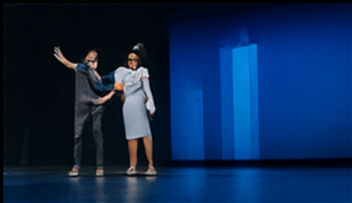
Event Production & Management