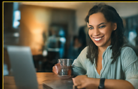
Social Media & Marketing