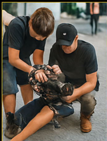
Film & Television Production