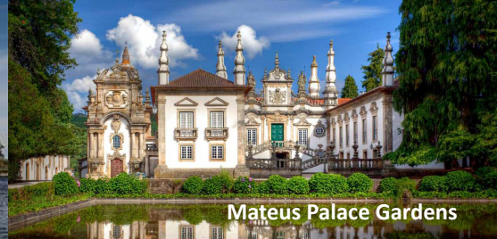
Mateus Palace Gardens