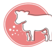
Animal Bank Program (Cambodia)

HOPE’s sustained engagement in resolving water, health, and food security issues are designed to help achieve the 2030 UN SDGs. Many organizations, including HOPE, are working to end global poverty by focusing on these SDGs.