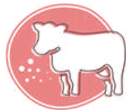
Animal Bank Program (Cambodia)

HOPE's sustained engagement in resolving water, health and food security issues are designed to help realize by 2030 the SDGs that were adopted by the UN to address global challenges. Many organizations, including HOPE, are working to end global poverty by focusing on these SDGs.