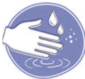
Health & Sanitation (Ethiopia · Cambodia)