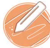
Educational Support (Philippines · Cambodia)