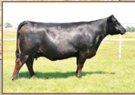
GREAT GRAND DAM: SITZ PRIDE 88T

- This Crank son has the highest yearling ADG of his 111 half sire siblings and an adj 205 Index of 109% & adj 365 indexes of 105% out of a cow that has a Gold ranking in HerdTrax. - His grand-dam, Sitz Pride 88T, sold for $200,000 half interest at EXAR 2013 sale which is a pathfinder dam recording WR 3@110, YR 3@112, and %IMF 9@113. She ranks in the top percentiles for many carcass and performance attributes in the breed.