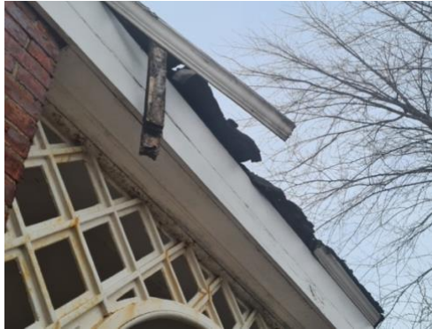
February 2023 (from correspondence with Parks)