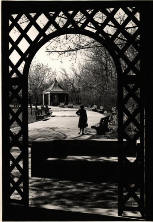
1930s or 1940s