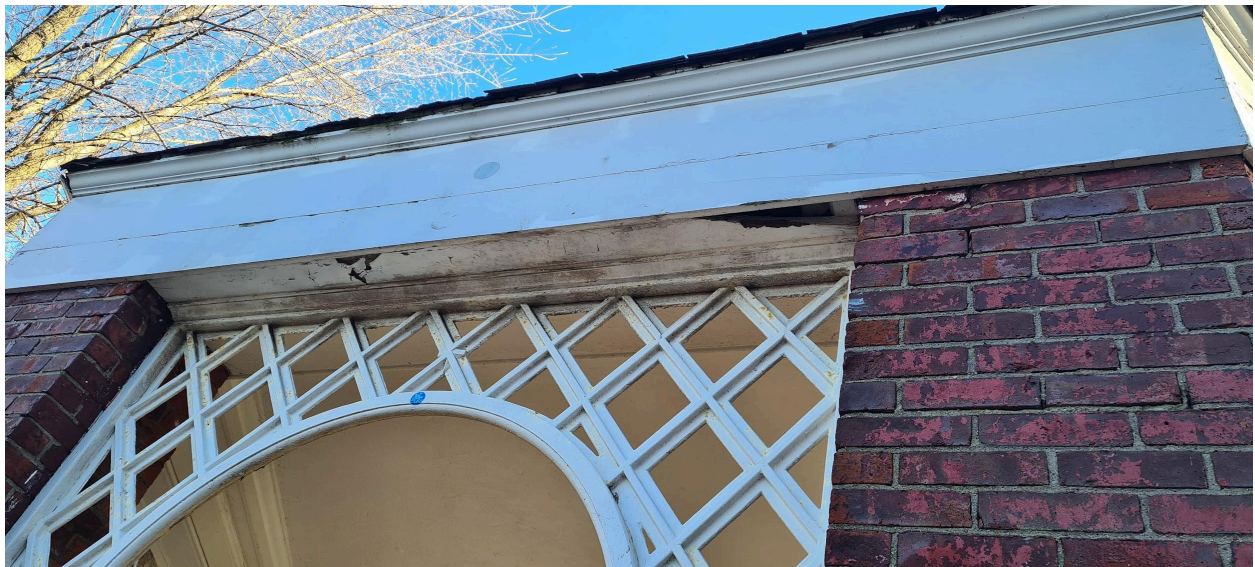
Southern Gazebo, current damage: