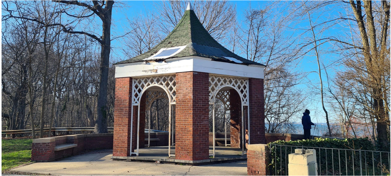
Northern Gazebo, current damage: