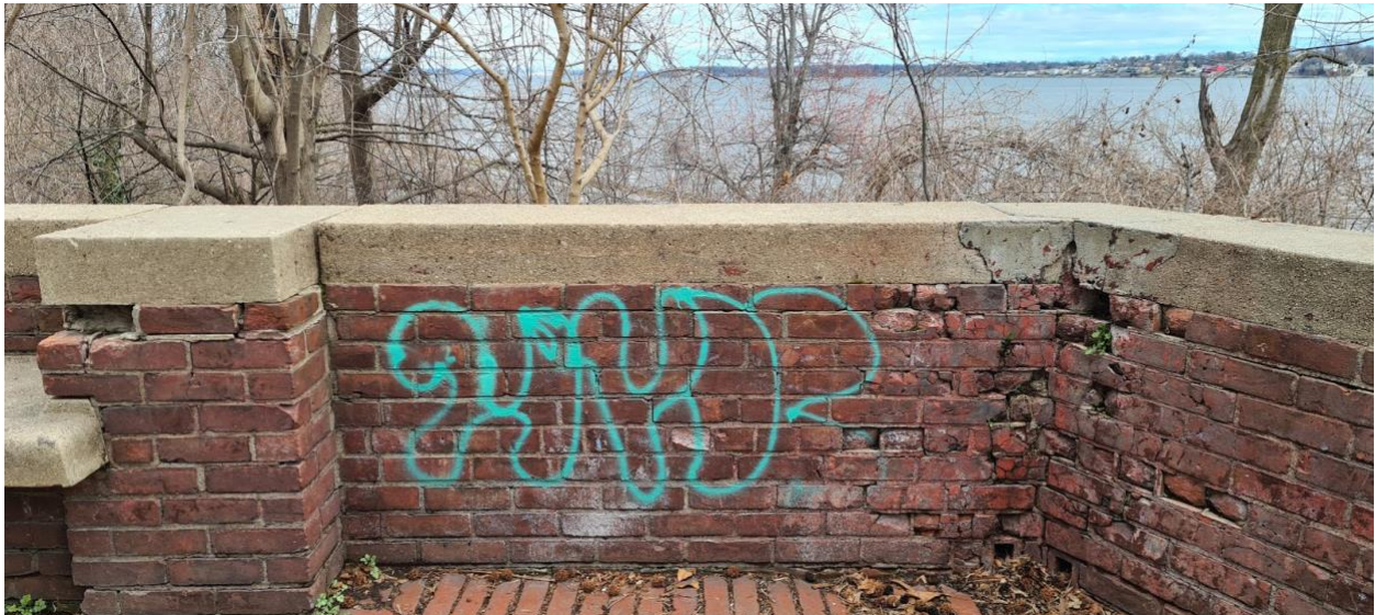
March 2022 (from correspondence with Parks)