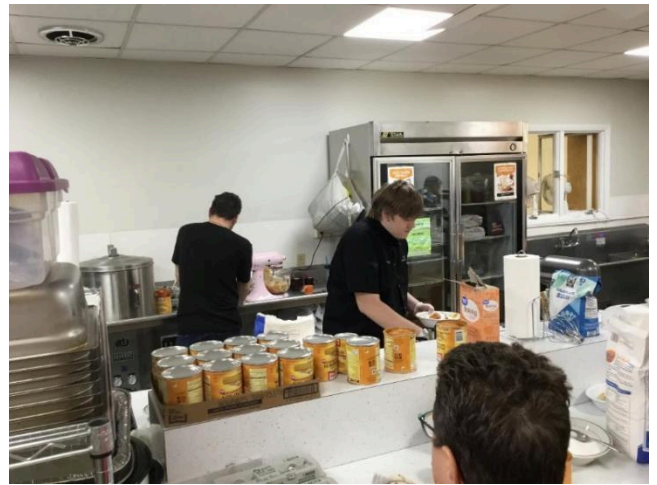
Opening cans of pumpkin and preparations for baking