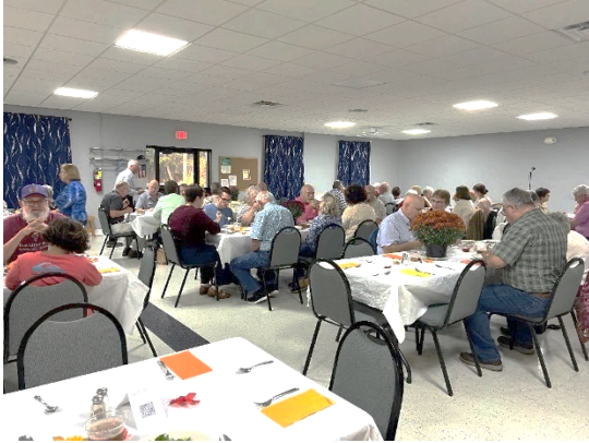
Everett Church of the Brethren Social Hall