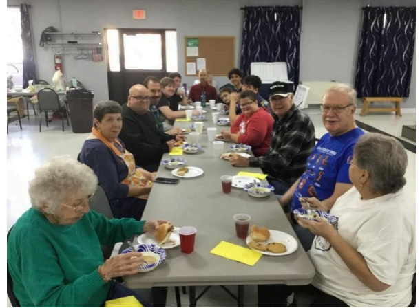
Ministry Committee and volunteers break for lunch