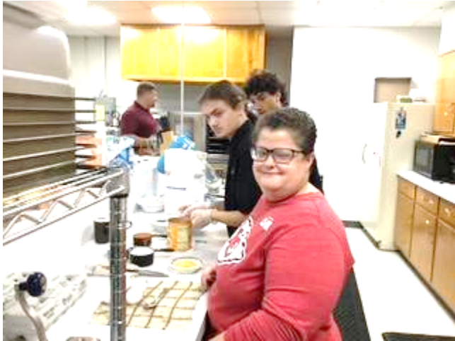
Culinary students and friends working in the kitchen