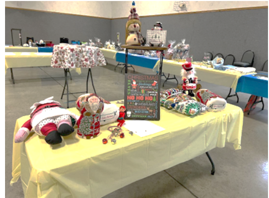
Christmas themed items