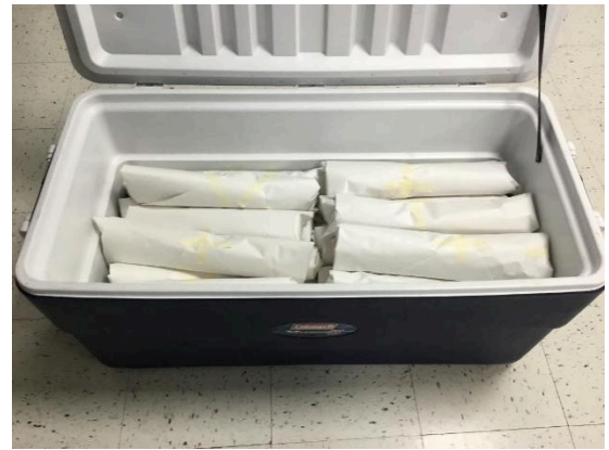
Finished rolls are stored until pick up or delivery