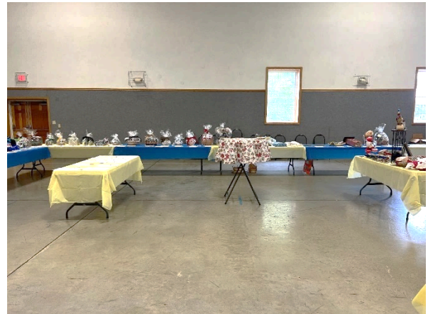
Multiple tables arrayed with Sale items