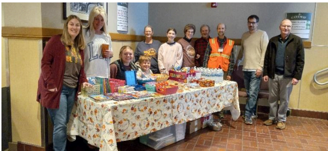
Snake Spring Church of the Brethren host Thanksgiving Hospitality Table