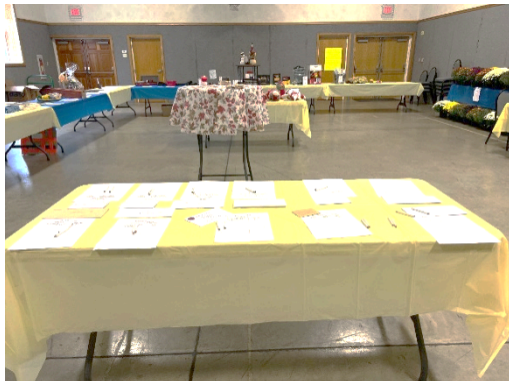
Gift Certificates Generously Donated from area businesses