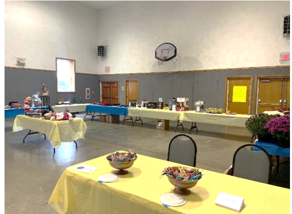
Everett Church of the Brethren Multi-purpose room