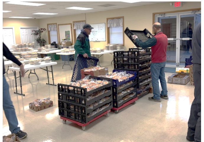
Assembled sandwiches ready for sorting into orders