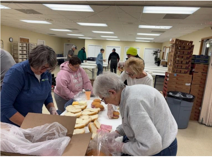
Assembly line work makes the work go quickly and efficiently