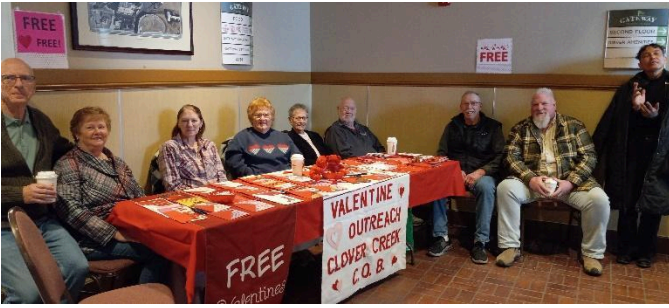
Clover Creek Brethren hosts Valentine Outreach