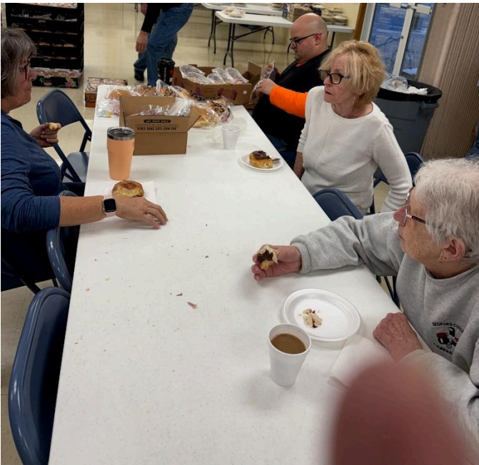
Pies sorted and sandwiches assembled and separated, the workers enjoy fellowship and refreshment together