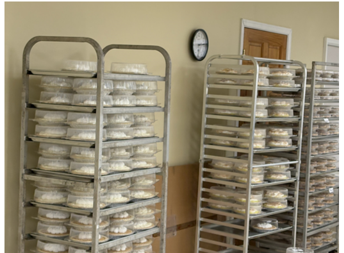
Pies on racks waiting to be separated into groups for delivery/pickup