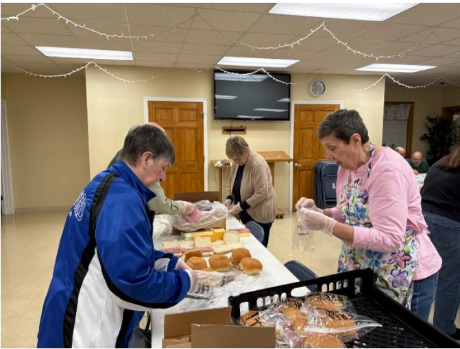
Several stations of volunteers assembled the sandwiches in less than two hours.