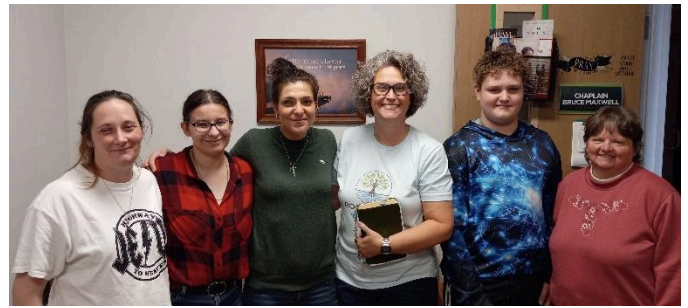
New Enterprise Brethren, “Made for More” volunteers, and visitor to the table tour ministry office

There were some representatives from “Made for More” ministry in Martinsburg, who did an excellent job extending themselves in ministry and service!