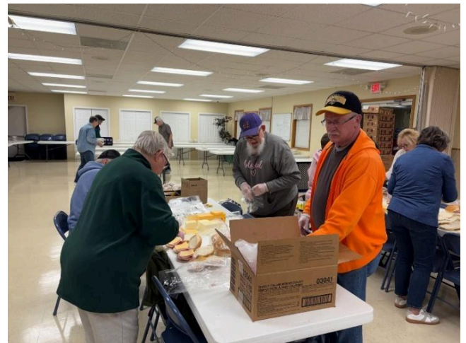
Volunteers assembling sandwiches

The community, businesses and churches help make this Ministry visible in the transient highway corridors of Bedford Country. We endeavor to share Christ with those who may encounter Him for the first time, or among those who do know Him and need assistance while on the road.