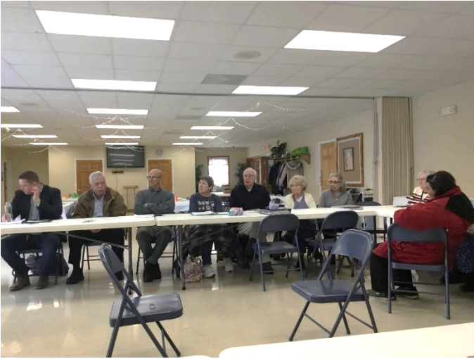
Attendees listen to reports of the Ministry