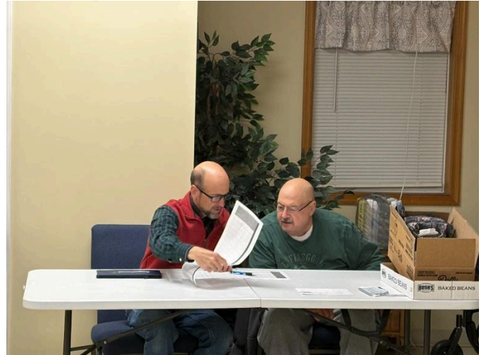
A fundraiser is not complete without collection of money for the sales