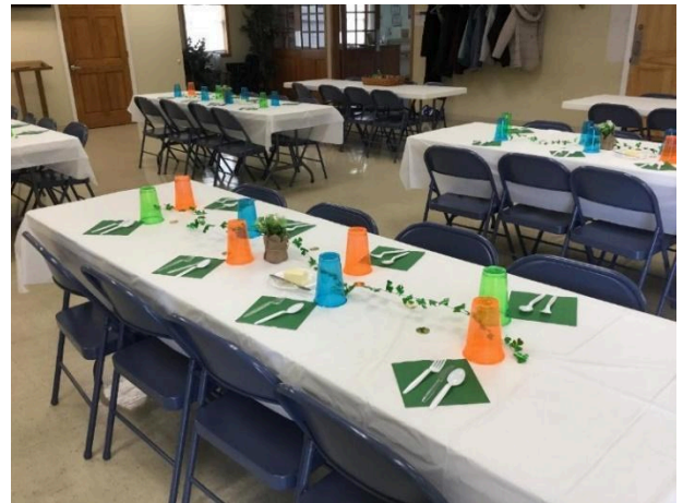
Tables decorated and prepared for dining