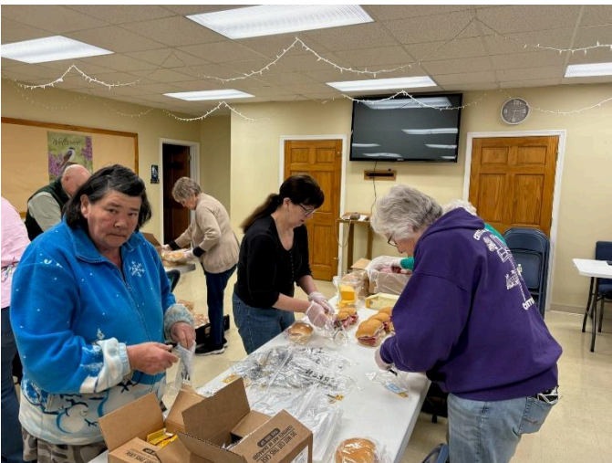
Volunteers hard at work assembling sandwiches