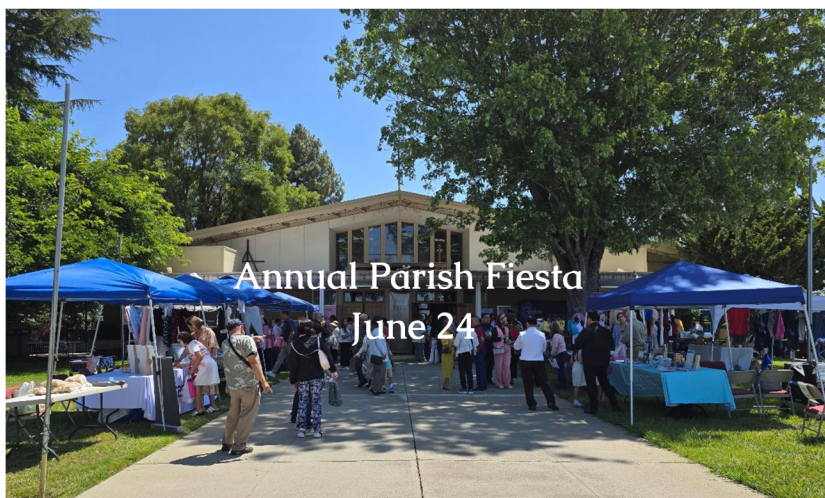
Annual Parish Fiesta June 24