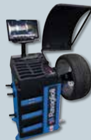
G3.150 Ravaglioli Electronic Wheel Balancer.