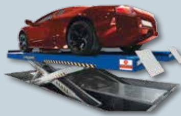
RAV640N.2l not in xls or page11?? Ravaglioli Vehicle Hoist.