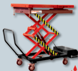
AA49010 Alemlube Automotive 1,200kg.