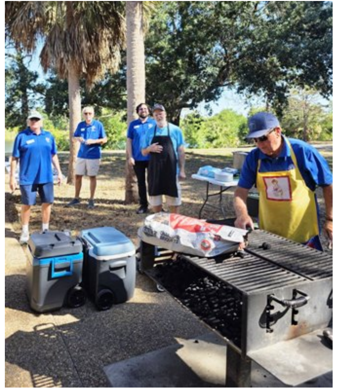
Largo Lions barbeque at the Lighthouse Family Picnic at Walsingham Park