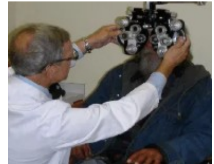
Veteran Medical Staff