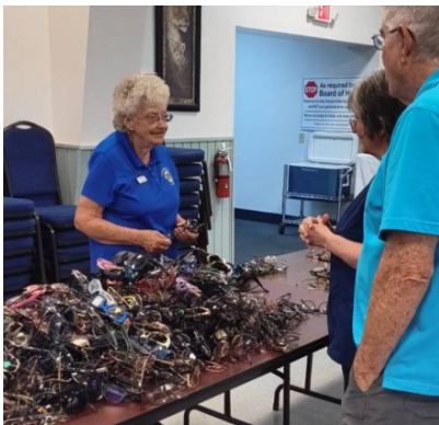
Eyeglass sorting Plant potting Plastic Bag recycling