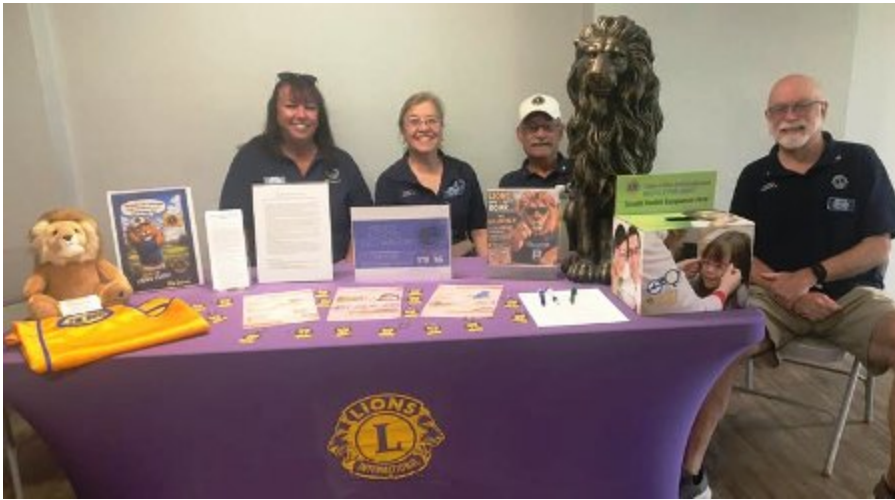
Safety Harbor Lions information station at the Hamptons Apartments