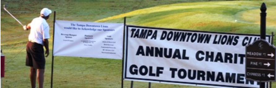
at the Carrollwood Country Club