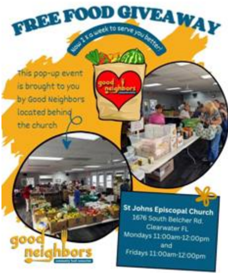
Safety Harbor fights hunger by supporting food drives at St. John's Episcopal Food Pantry and prepping for Hands Across the Harbor