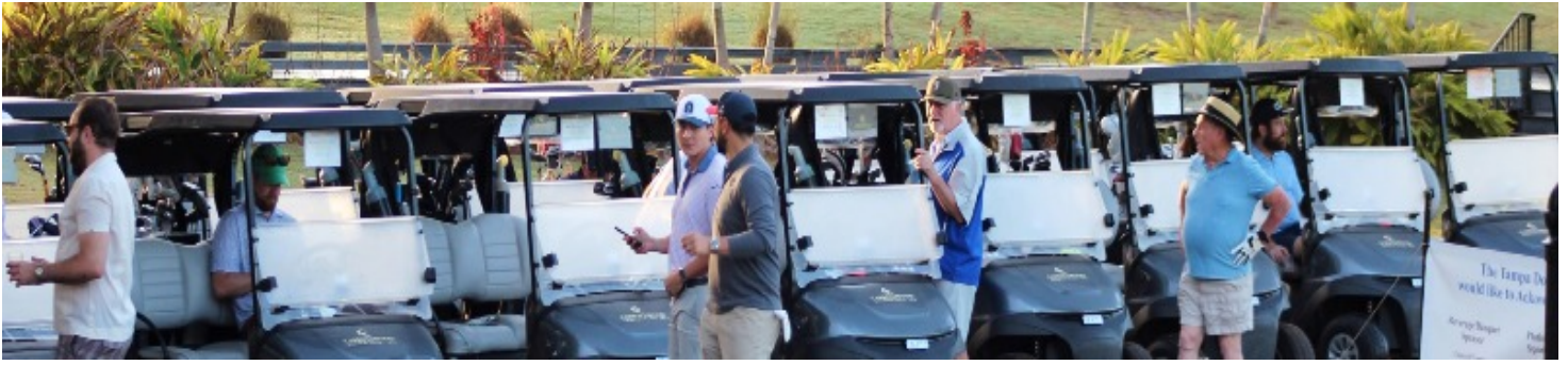
Gentlemen (and Ladies) “Start your Engines”