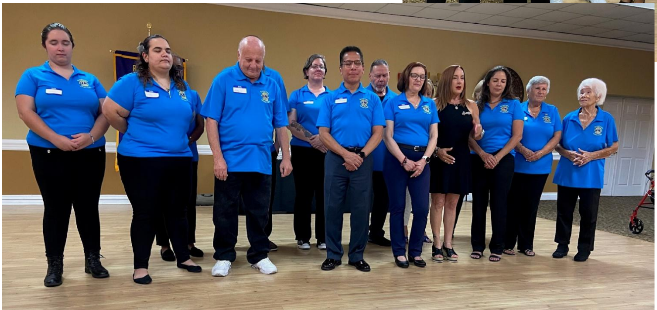
Members of the new Riverview Lions Club – inducted June 13.