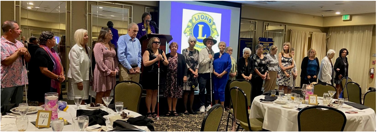
Members of the Southwest Florida Lighthouse Lions Club were inducted June 26. The Event was held at the Venezia Hotel in Venice.