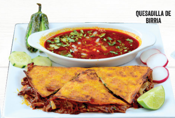
QUESADILLA DE BIRRIA