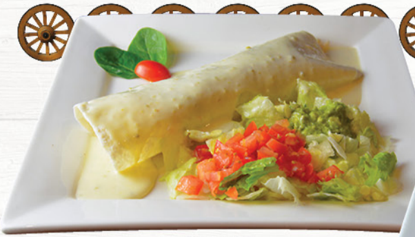
GRANDE BURRITO FAJITA