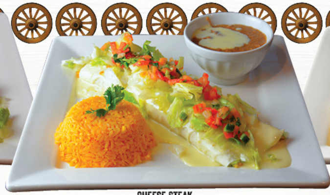
CHEESE STEAK BURRITO