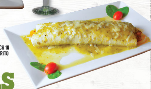
LUNCH 18 BURRITO