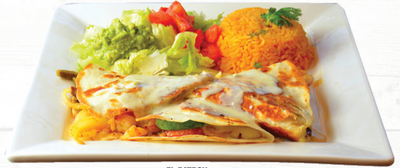
EL PATRON SPECIAL