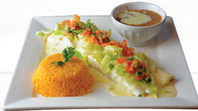
LUNCH 17 CHEESE STEAK BURRITO

10 inch flour tortilla stuffed with shredded chicken, avocado and cheese, topped with cheese sauce, red sauce and sour cream, served with rice and black beans 14.99