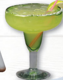
Lunch Lime Margarita 12 oz. 5.99