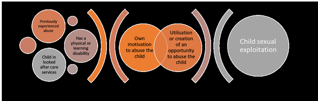
Diagram from Eaton & Holmes (2017, p38) arguing that the experiences of a child are separate from the abuse, with the central factor being the offender's motivations and opportunities to abuse

In Eaton & Holmes (2017), a diagram from Eaton separates vulnerabilities from the act of sexual violence against children, placing the offender in the centre of the process.