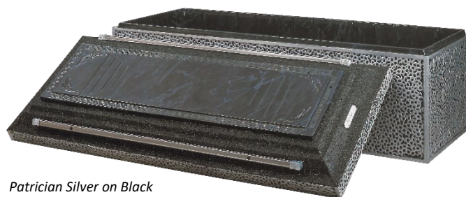
Patrician Silver on Black