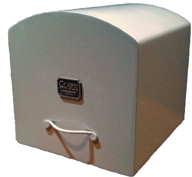
1/8th Inch Aluminum Urn Vault