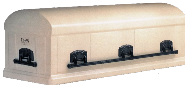
Brownstone 1/8th Inch Aluminum