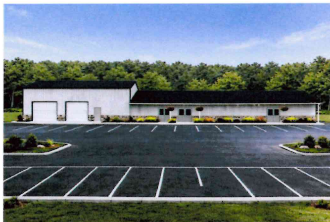
A concept photo of the new Trade Store

God is good. God is at work. God is faithful! Thank you for your prayers as we continue the planning for the new Trade Store. Please also be in prayer for our Board Retreat on May 8th & 9th as we continue seeking God's will for GCM.