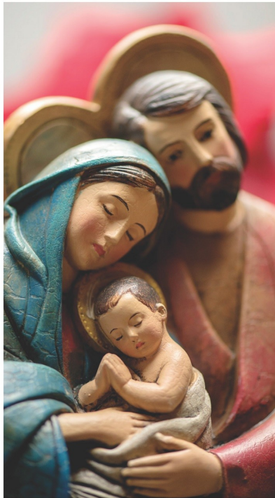
Mary, Joseph and the baby Jesus are depicted in a wooden creche at Sacred Heart Cathedral in Rochester, N.Y., in this Nov. 24 photo.

If God draws us to himself with love, and not through guilt or compulsion, how important it is that we, too, should witness to our faith in the same manner. How important this is in building up a culture of life! As many of us approach the New Year with resolutions, this seems an appropriate time to consider our pro-life witness in the light of charity.