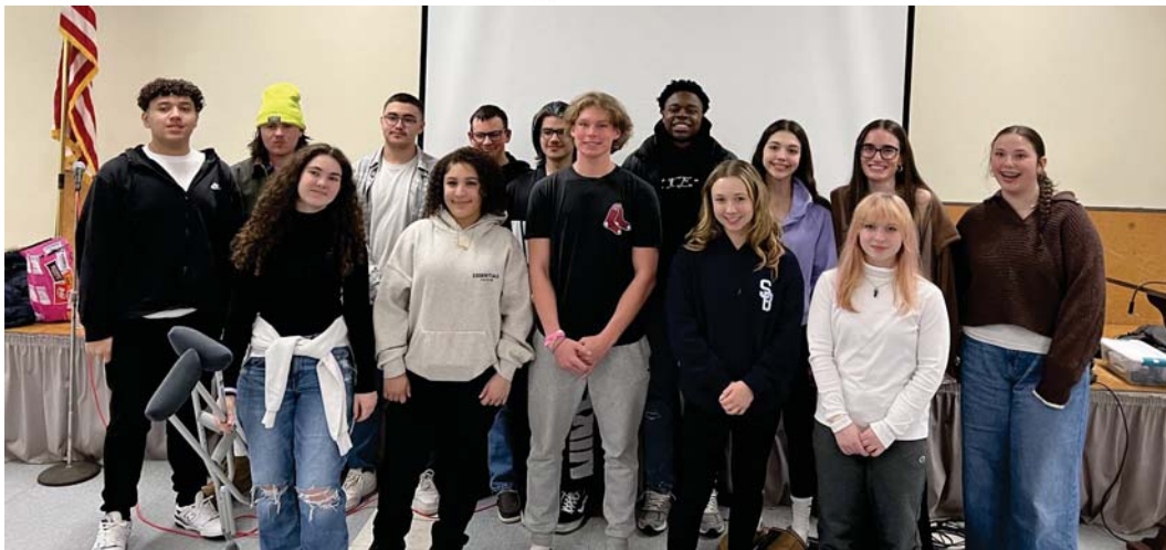
Confirmation retreat, March 23rd, 2024