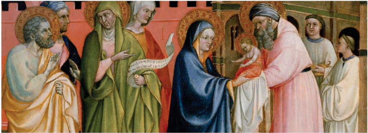
The Presentation in the Temple, Alvaro Pérez Portuguese, The Met Museum

“We too are called to welcome Jesus who comes to meet us. To encounter him: the God of life is to be encountered every day of our lives; not now and then, but every day. To follow Jesus is not a decision taken once and for all, it is a daily choice.” —Pope Francis, Feast of the Presentation of the Lord, 2019