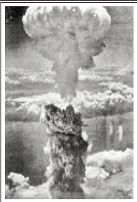
1945 What price world peace