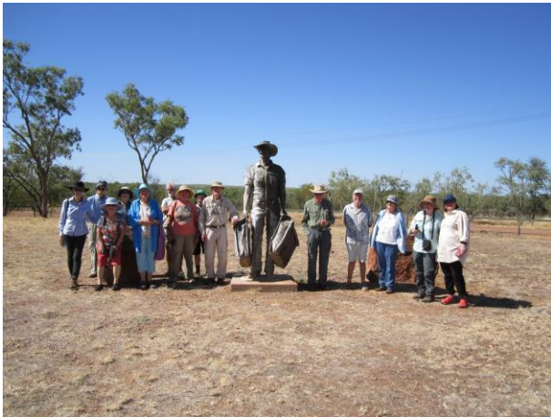
A group photo at the Pic Willetts statue, Newcastle Waters

This year our trip was taken in the Daly Waters, Newcastle Waters and Elliott region.