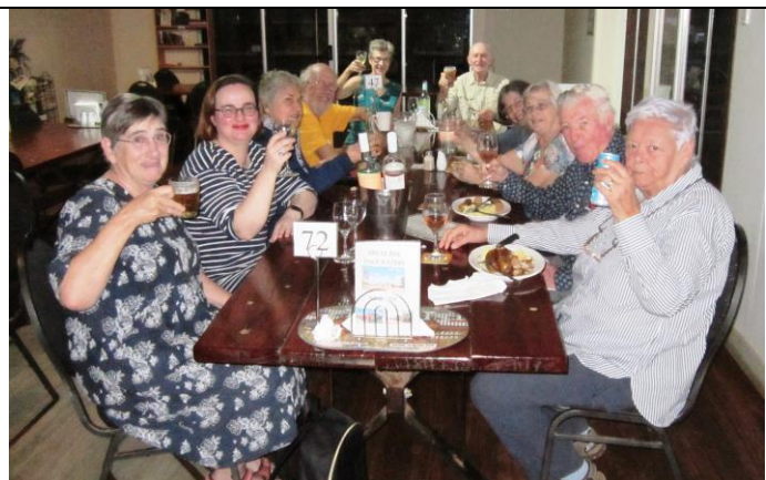
Dinner at HiWay Inn, Daly Waters