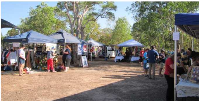
Stalls at Southport