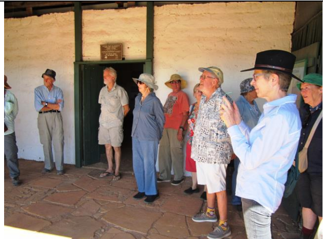
The group at the front of Jones Store, Newcastle Waters