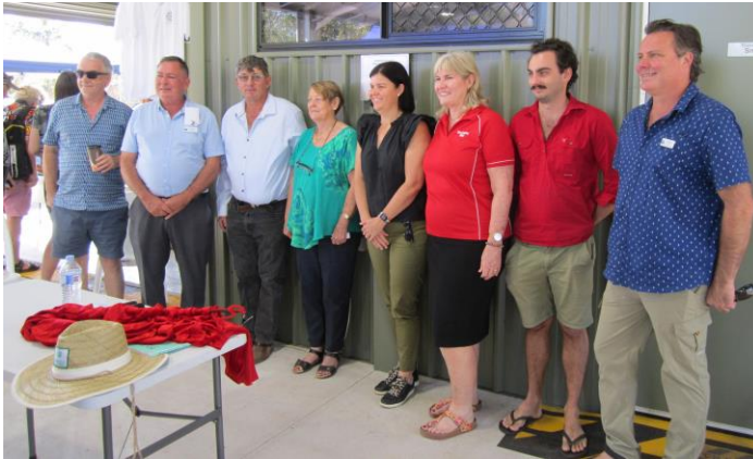
Natasha Fyles & Eva Lawler with the Southport Progress Association Committee

This event was well attended and supported by many stall holders. Natasha Fyles, Chief Minister and Eva Lawler, MLA Drysdale also attended the event. It was lovely cool dry season morning with the smell of good hot coffee in the air.