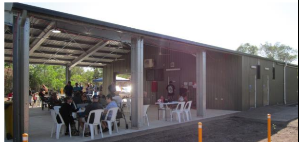
The new community hall