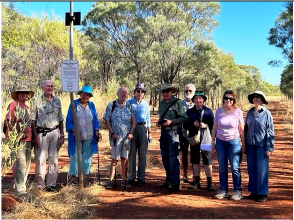
The group at the Overland Telegraph Station joining poles, Hayfield Station.