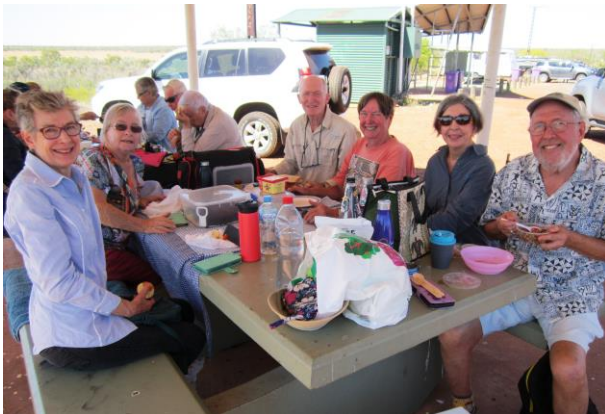
Lunch at Newcastle Waters