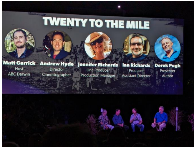
Question and Answer time at the end of the documentary