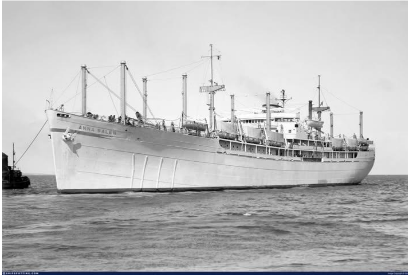
The Anna Salen